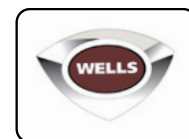
Ventless Hood Systems