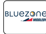
Air Filtration | Air Purification