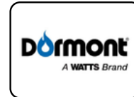
Gas Connectors | Hoses