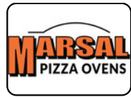
Deck Ovens | Pizza Ovens